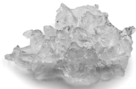
MF 69 SPLIT CO2 Flake ice Contenuto d'acqua residua 25%