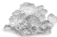
MF 69 SPLIT CO2 Flake ice Contenuto d'acqua residua 15%